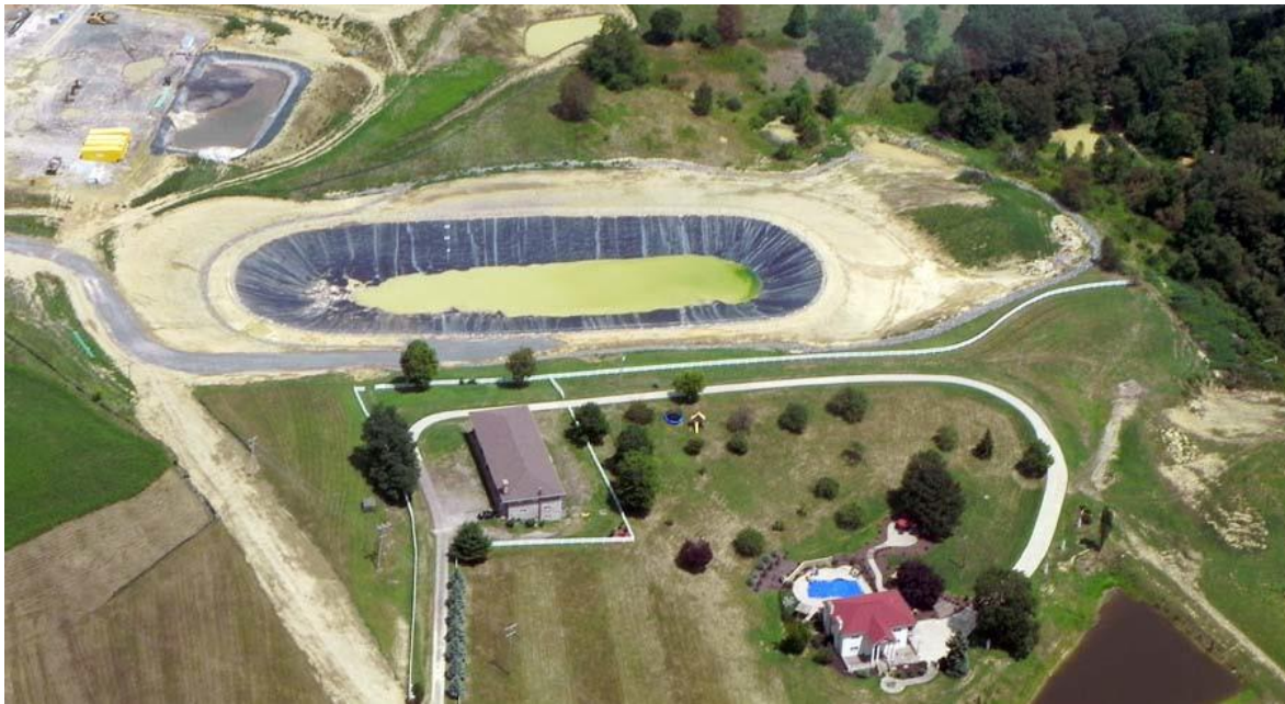
A hydro-fracking drilling pad and storage pond in Pennsylvania show the proximity to the homeowner's house as well as the large scale of the operation.

acute health issues popping up throughout Pennsylvania and now Ohio, believed to be in response to drilling practices, we have concern this is just the tip of the iceberg when radium eventually migrates into source water for public drinking supplies and leaches out of landfills. When ingested, radium concentrates in bone and can increase the probability of leukemia. The serious health effects as a result of radiological exposure are not readily apparent as victims first endure a latency period. This means that although residents could be currently exposed, their symptoms may not appear until years from now.