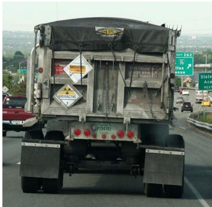
A truck marked as “radioactive” traveling on a highway near Golden, Colorado.

Finally, federal DOT regulations require that hazardous and radioactive shipments be properly placarded. Specifically, federal DOT regulations require this notice: “RADIOACTIVE—LSA” or “RADIOACTIVE—SCO.” Instead, trucks we have seen on Pennsylvania highways are simply labeled “brine.”